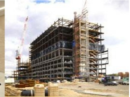
Turn Key Solutions Construction( Civil ) with Interior

Residential Construction , Commercial Buildings , Interior Designing , Construction Management , 3D Building Plan , Structural Consultant