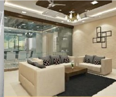
Home interior desiners in chennai