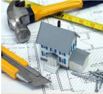
House renovation in chennai